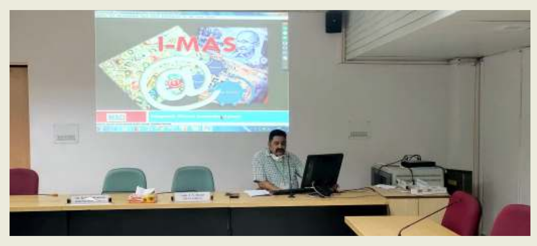
(Speaker addressing on webinar to participants of IMAS Training Programme)

A 1-day IVFRT (consular) training was conducted on 13 June through webinar. The training was attended by 51 participants.