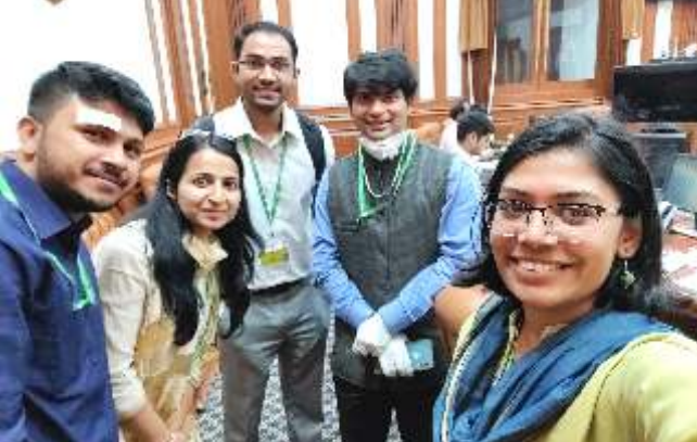
(Deployment of IFS OTs at COVID-19 Control Room, MEA, New Delhi)