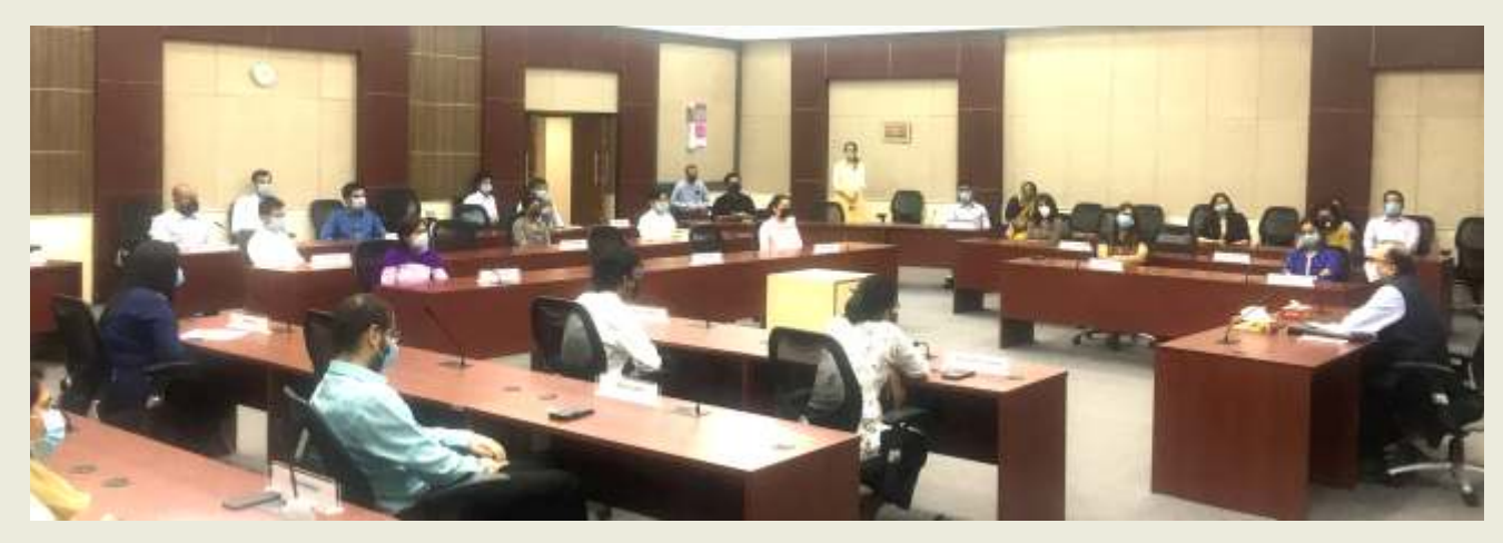
(Address by Dean (SSIFS) to IFS OTs in the Phase-II of ITP)